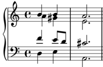
Fig. 1. Example of a Picardy third from the end of J. S. Bach’s chorale, Zeuch ein zu deinen Toren (BWV 28/6). This cadential figure employs all and only the pitch classes in a harmonic major scale set.

Let \mathcal{H} = \mathcal{H}_{\min} \cup \mathcal{H}_{\text{maj}} . \mathcal{H} will be called the set of harmonic scale sets . The set \mathcal{F} , associated with Piston’s “fundamental diatonic scales” is closed under transposition, but not under inversion. The smallest inversionally closed superset